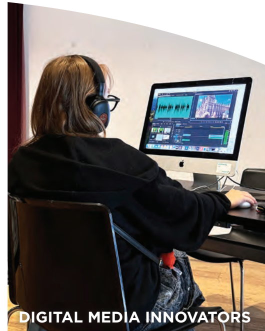
DIGITAL MEDIA INNOVATORS